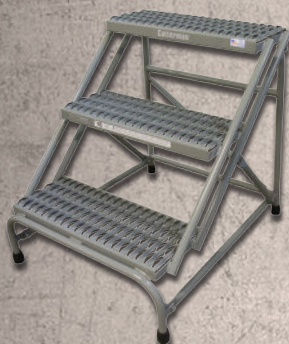
Model No. STP-1401

Step Count: 2 Overall Dimensions (inches) 23D x 23W x 20H Tread Size (inches) 10D x 20W Welded Rubber Feet and Casters Packaging: Shrinkwrapped