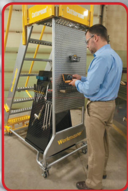
STANDARD BACK TOOL BOARD