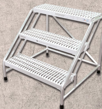
Model No. STP-1803

Step Count: 3 Overall Dimensions (inches) 33D x 26W x 30H Tread Size (inches) 10D x 22W Unassembled Rubber Feet Packaging: Box