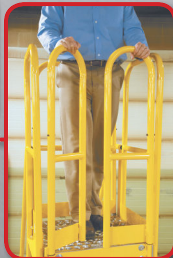
OPTIONAL REAR SELF-CLOSING GATE