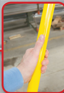
1.5" TUBE HANDRAILS POWDER COATED