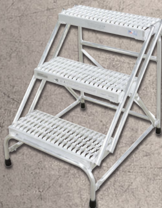
Model No. STP-1901

Step Count: 2 Overall Dimensions (inches) 22D x 23W x 20H Tread Size (inches) 10D x 20W Welded Rubber Feet Packaging: Shrinkwrapped