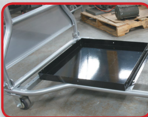
OPTIONAL UTILITY TRAY 150 lb. CAPACITY