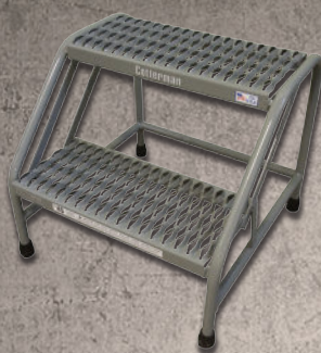
Model No. STP-1301

Step Count: 2 Overall Dimensions (inches) 23D x 23W x 20H Tread Size (inches) 10D x 20W Welded Rubber Feet Packaging: Shrinkwrapped