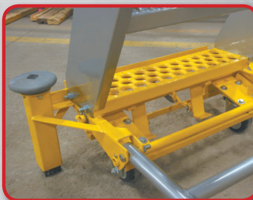
MODULAR FRONT LEG AND SAFELOCK FIELD REPLACEABLE, ADJUSTABLE FRONT LEGS LEVEL THE LADDER