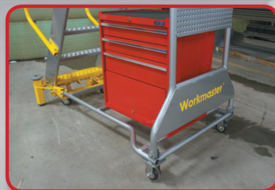
HEAVY DUTY CASTERS, CURVED BASE AND BACK PANEL AND BOLT LOCATION FOR EASY ASSEMBLY