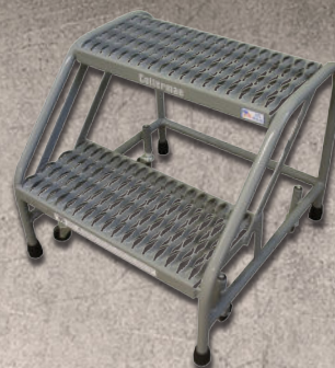
Model No. STP-1302

Step Count: 2 Overall Dimensions (inches) 23D x 23W x 20H Tread Size (inches) 10D x 20W Welded Rubber Feet Packaging: Shrinkwrapped