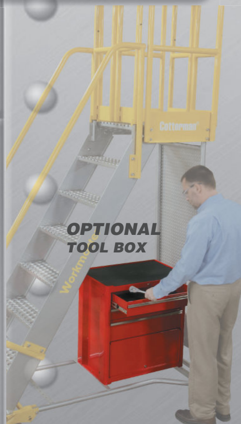
OPTIONAL TOOL BOX

24" x 24" PLATFORM WITH OPTIONAL SELF-CLOSING GATES, FULLY ENCLOSE PERSONNEL. TOEBOARDS AND 42" GUARDRAILS STANDARD