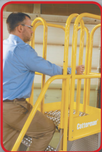
OPTIONAL FRONT SELF-CLOSING GATE