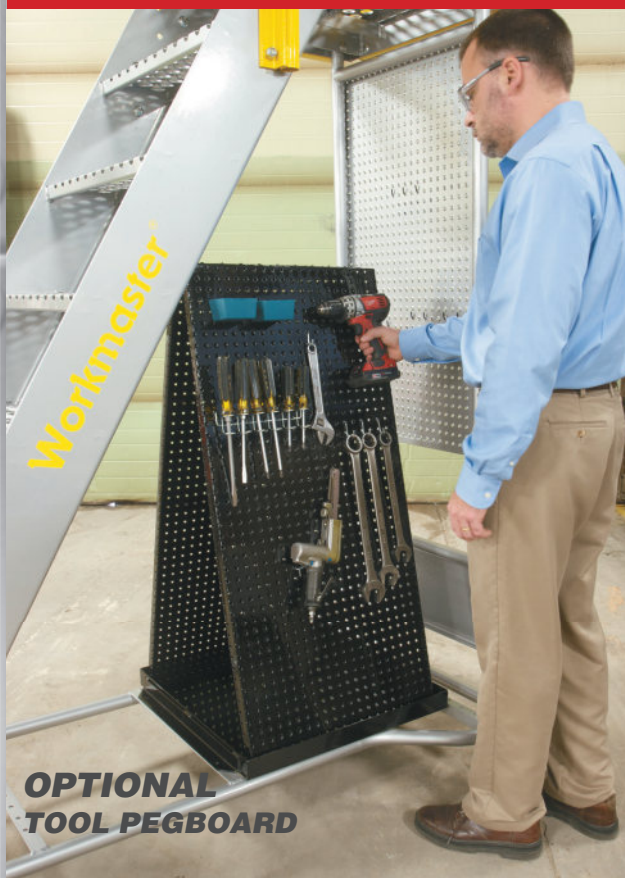
OPTIONAL TOOL PEGBOARD

For the toughest work areas, step up to the Cotterman Workmaster Super Duty.