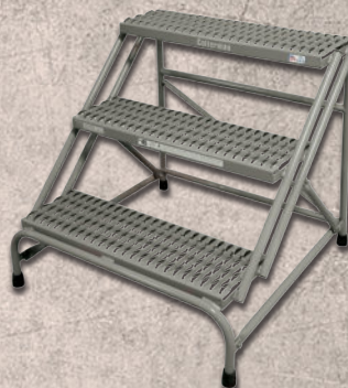
Model No. STP-1402

Step Count: 3 Overall Dimensions (inches) 33D x 26W x 30H Tread Size (inches) 10D x 22W Unassembled Rubber Feet Packaging: Box