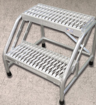
Model No. STP-1802

Step Count: 1 Overall Dimensions (inches) 16D x 31W x 10H Tread Size (inches) 12D x 28W Welded Rubber Feet Packaging: Shrinkwrapped